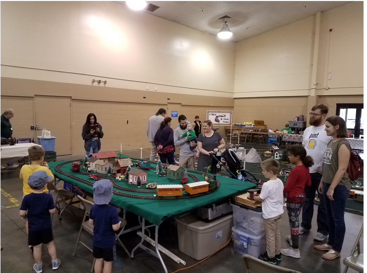
Kids had a great time running trains.